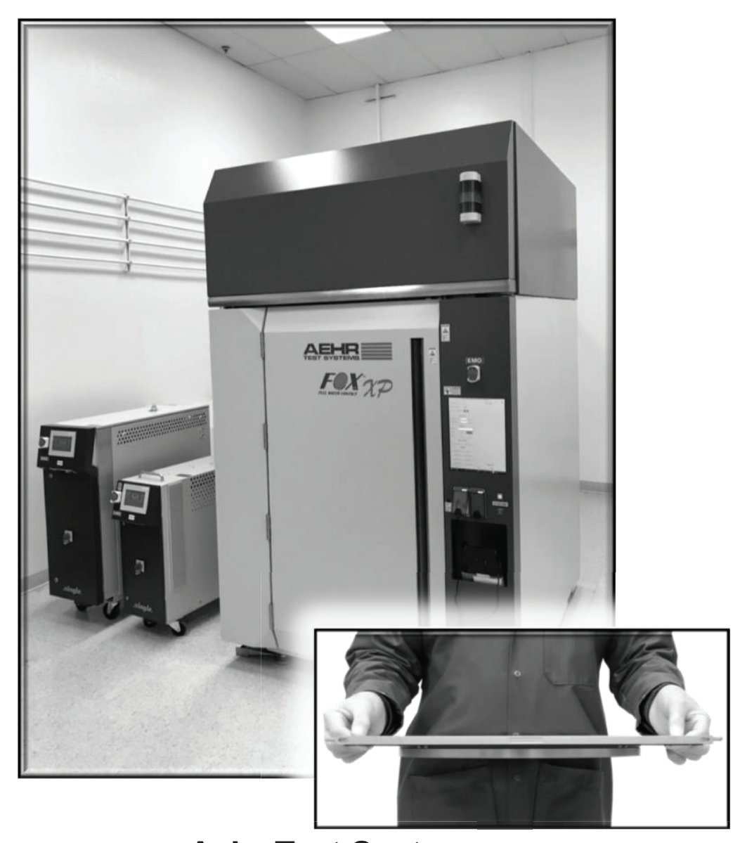
Aehr Test Systems FOX-XP Multi-Wafer Test & Burn-in System & WaferPak Full Wafer Contactor