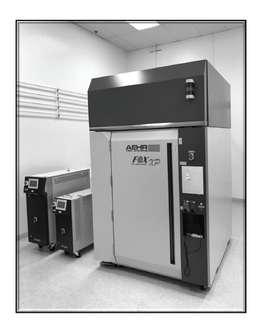
Aehr Test Systems FOX-XP Multi-Wafer Test & Burn-in System