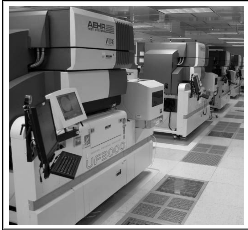
Aehr Test Systems FOX-1 Full-Wafer Test System Installation