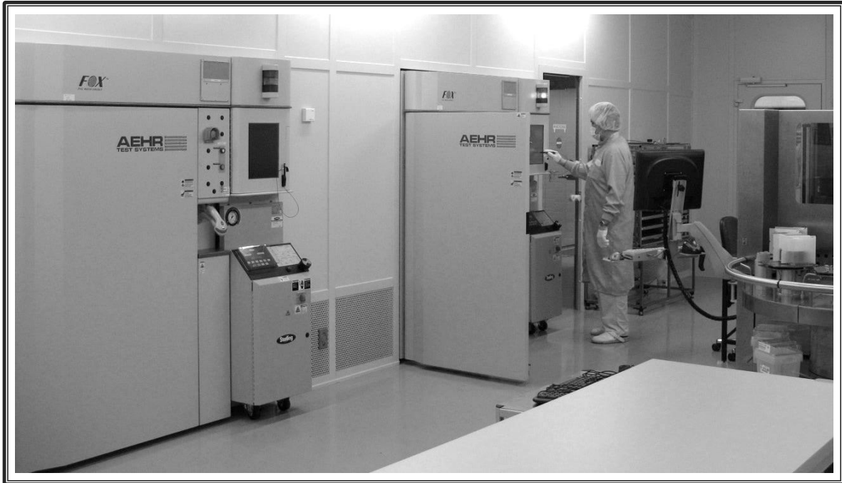
Aehr Test Systems FOX-15 Wafer-Level Test and Burn-In System Installation