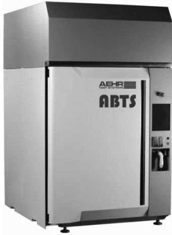
Packaged Part Burn-in